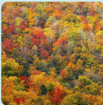
MASSACHUSETTS TRI-CITIES IMPROVED FOREST MANAGEMENT PROJECT MASSACHUSETTS, USA