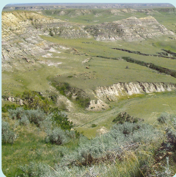
CARROLL GRASSLANDS AVOIDED GRASSLANDS CONVERSION PROJECT MONTANA, USA

The Good Traveler supports 10 active, accredited carbon offset projects throughout North America, including forestry, grassland conservation, solar and clean energy, composting and more. Featured below are 3 examples from the current portfolio.