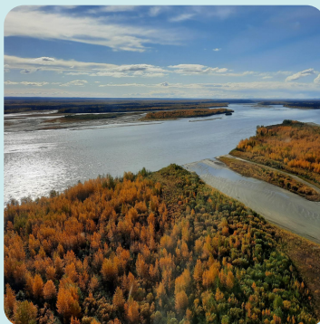
DOYON IMPROVED FOREST MANAGEMENT PROJECT ALASKA, USA